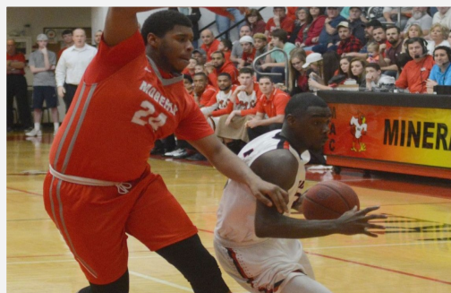
66-58 win over #4 Moberly on January 21 st

Mineral Area College Athletics has a long rich history of competitive success on the court and academic success in the classroom.