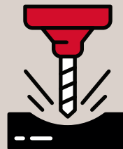
INTRO TO CNC