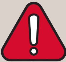
SAFETY (OSHA-10 CARD)

The 8-week rotating course covers topics like: